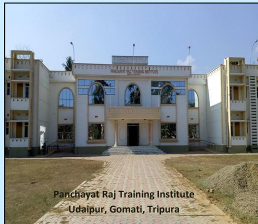
Panchayat Raj Training Institute Udaipur, Gomati, Tripura