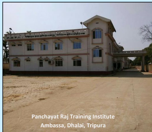
Panchayat Raj Training Institute Ambassa, Dhalai, Tripura