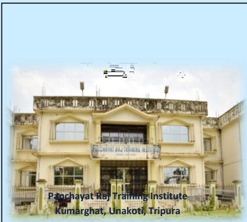
Panchayat Raj Training Institute Kumarghat, Unakoti, Tripura